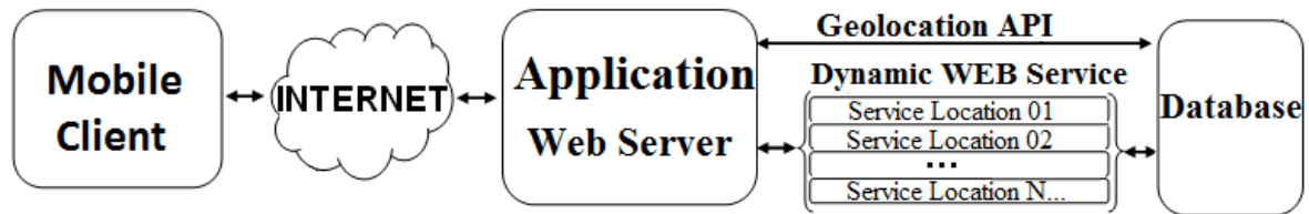
Figure 1. Architecture of the SocialNetLab

As the Geolocation API serves only for four types of location technologies, we realized the need to implement another solution that will serve the higher number of location technologies available in the market. In an attempt to guarantee the independence of location technology in mobile device is that the idea appeared of using the Web Service Dynamic (Murray et al, 2006), so that the system will go automatically search for the appropriate service for the technology of available location in the equipment. In the figure 1 we can see the architecture of the SocialNetLab SNS.