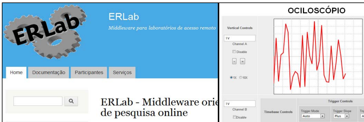
Figure 3. ERLab and oscilloscope

The ERLab is a middleware for remote access laboratories (Ribeiro et al, 2012). It allows users to access various resources (oscilloscopes, signal generators, multimeters, reprogrammable hardware, among others) at a distance, through Internet. (Feistauer et al, 2010). In figure 3 we can see the homepage of the ERLab and an oscilloscope in functioning through the ERLab.