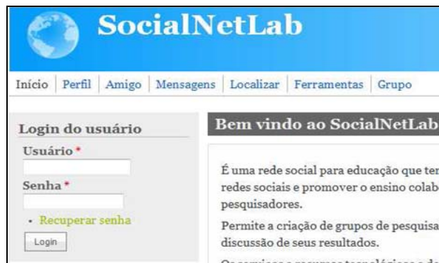
Figure 2. Prototype of the initial web page of SocialNetLab

The ERLab is a middleware for remote access laboratories (Ribeiro et al, 2012). It allows users to access various resources (oscilloscopes, signal generators, multimeters, reprogrammable hardware, among others) at a distance, through Internet. (Feistauer et al, 2010). In figure 3 we can see the homepage of the ERLab and an oscilloscope in functioning through the ERLab.